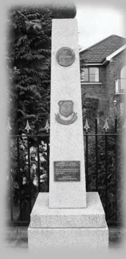
Memorial at Milltown, built by supporters of Shamrock Rovers

The project will produce an online searchable database for use by the general public. Users will be able to search the database by sport and by county.