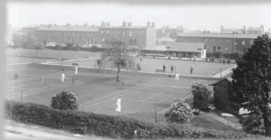
Tennis Club, Grosvenor Square, Rathmines, Dublin

Telephone: (00353) (0)1 614 7452 Email: Higgins@irishsportingheritage.com Web: www.irishsportingheritage.com