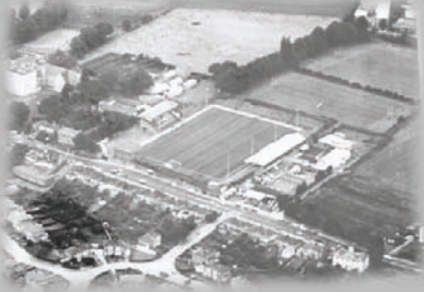
Shamrock Rovers' former ground in Milltown which was sold to developers in 1987

Heritage is that which is passed down from preceding generations. It is part of the history and tradition of societies. Sport has been, and remains, one of the constants in the lives of Irish people. It provides the central locations of belonging and common ritual and sustains a sense of community, locality and nationhood. So integrated is sport into daily life that its significance in Ireland's heritage is often overlooked.