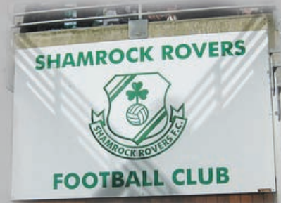
Shamrock Rovers' grounds in Tallaght, opened in 2009