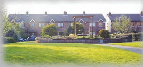
Housing estate on the former grounds